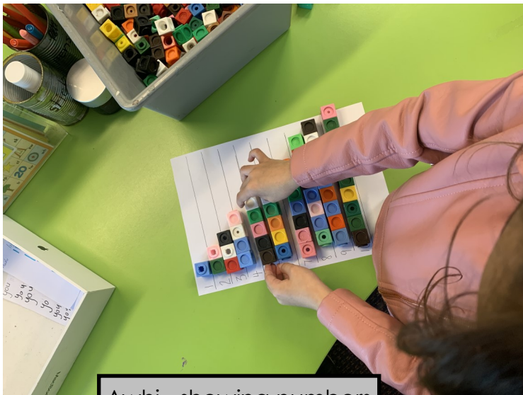
Awhi - showing numbers 1-10 with blocks