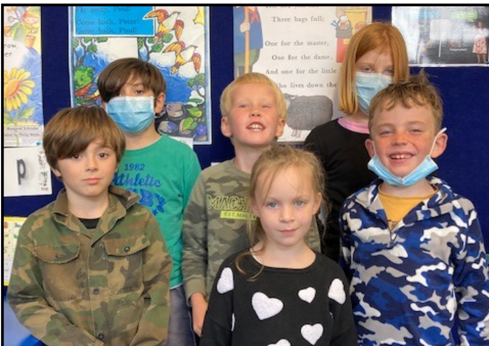
Our holiday reading prize winners.